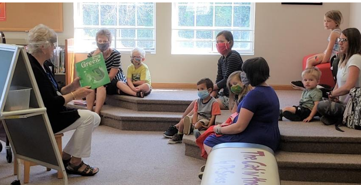
Toddlers and preschoolers enjoyed activities and stories during Summer Reading Story Time.