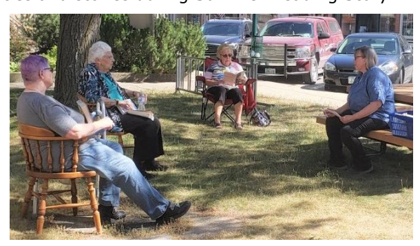
Book discussion group meets outside.

"Great discussion; the exact reason I love coming to the Elkader book club."