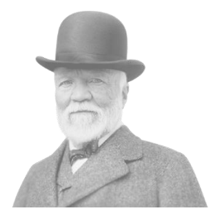
"A library outranks any other one thing a community can do to benefit its people. It is a never failing spring in the desert." ~ Andrew Carnegie

Books, Magazines, DVDs, & Audiobooks: 12,642 check-outs Puzzles, Cake Pans, Kits, & Equipment: 223 check-outs Public Computers & Wireless Network: Used 9,777 times BRIDGES Audiobooks, E-books, & Magazines: 4,556 items downloaded Website Including Online Catalog: Accessed 4,781 times Facebook: 782 Likes; 892 Followers